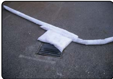
Pillow placed behind booms to absorb seepage