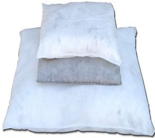
Envirosorb™ absorbent pillows

In today's environmentally aware world, the Control, Containment & Clean Up of Oil and Fuel Spills on water & land is an essential part of a company's compliance with AS1940:2004, ISO14001, Unauthorised Discharge Regulations 2004 or other requirements. Envirosorb™ Oil & Fuel absorbent pillows and bags help meet these obligations.