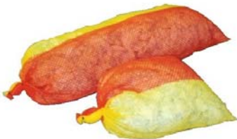
Envirosorb™ absorbent bags